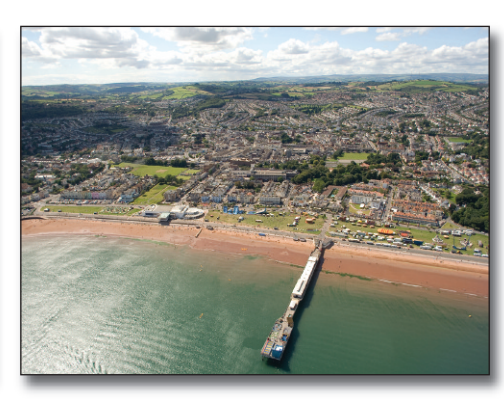
The Pier and Esplanade at Paignton.