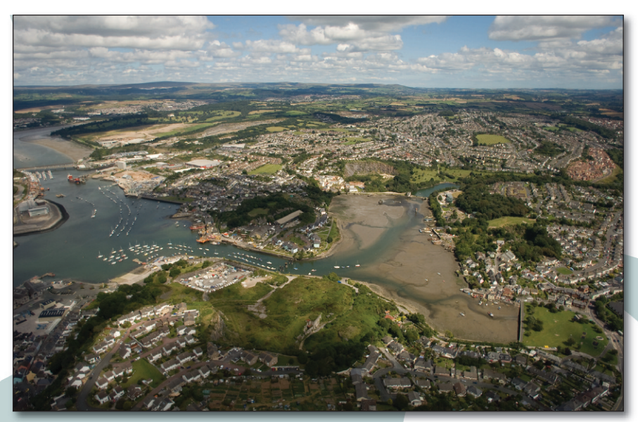
The Cattewater and the River Plym.