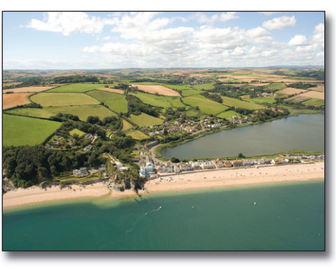
Slapton Ley is the largest freshwater lake in the South West and an important nature reserve.