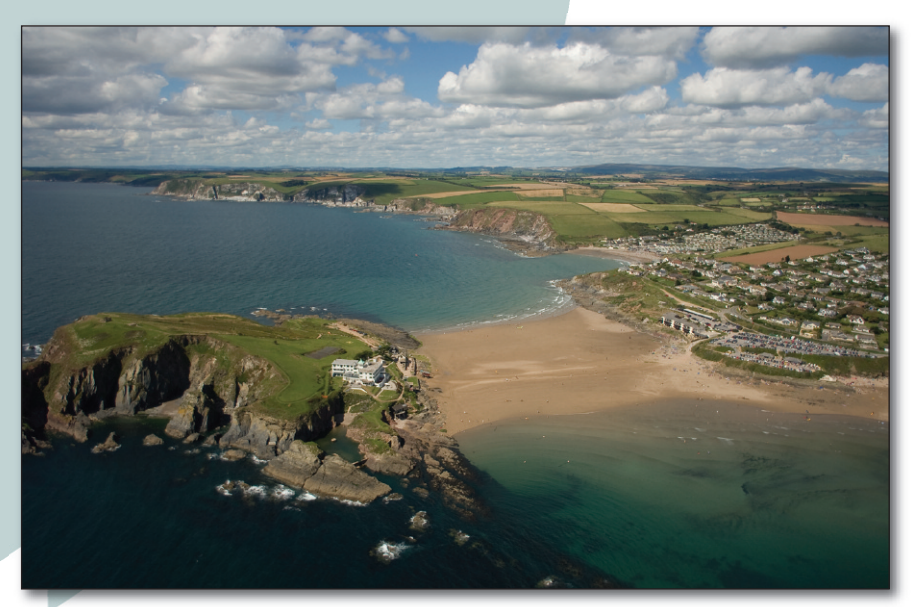
Famous Burgh Island faces Bigbury on the mainland.