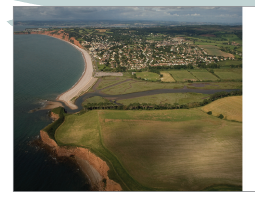
Sunny summer weather at Sidmouth.